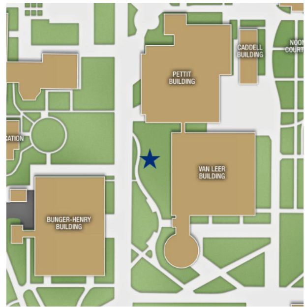
Figure 1. Preferred Location on GT Map

We looked at potential locations surround Van Leer and the new courtyard near the College of Computing.